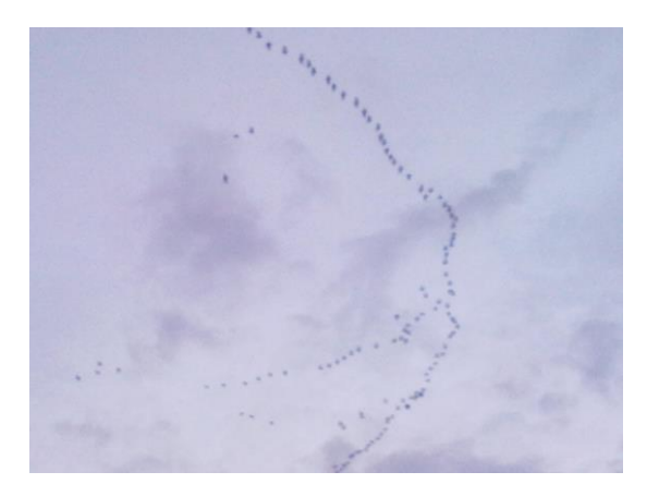
Fig. 1. A first group of birds (while in its directional motion) described in the Text, showing up signatures of right-angle and overall arrow-like (straight-line addressing) emergent, mesoscopic (Laughlin et al., 2000) 'nonlinear' patterns, accommodating to certain mild-weather local wind-, temperature- and respective humidity involving conditions in a region located in northern part of Poland

observations on collective groups' motions, a perennially alive subject of studies.