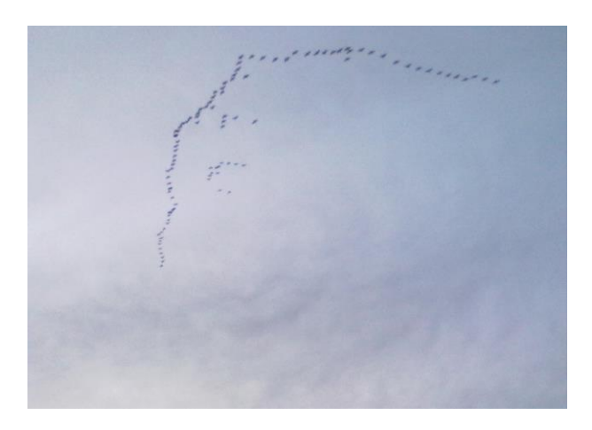
Fig.2. A (picturesque) evidence for the self-similar or "fractal-like" overall nearly right-angle zigzak pattern, manifested at the fronts' wedges, and thus, characteristic of bird flocks' destination flights in mild-weather conditions

grand unification of those two fields of physics, not mentioning that (birds') kinematics is always depicted in terms of geometry complemented by the time variable: the motions go over an observation time span for sure. Or, when anticipating many other circumstances, e.g. those concerning ecological systems, especially the ones with velocity alignment, cf. (Romanczuk & Schimansky-Geier, 2012), presumably with some distinctive involvement of stochastic force fields of space-and-time (un)correlated propensity for which Eq. (1) with f \sim 0 stands only for a crude linear approximation (Vicsek & Zafeiris, 2012; Laughlin et al., 2000). For natural systems approaching f \sim 0 one is encouraged to see (Scherge & Gorb, 2001).